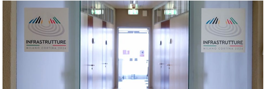
Milan Headquarters

“Focusing solely on design is not enough – it’s essential to consider the future and how the asset will be managed. Challenges are inevitable, but with Autodesk technology we’ve truly made a difference, simplifying operations and ensuring a smoother, more efficient process for everyone involved”.